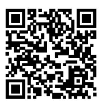
Customer Care Contacts

In case of any unexpected interruptions in the charging session, please contact the Enel X Way service center. Scan the QR code below to find out relevant customer care contacts.